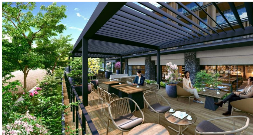
Image representation of restaurant terrace along Kyu-Karuizawa Ginza-dori Street

At the Hotel, a restaurant terrace was placed along Kyu-Karuizawa Ginza-dori Street for use by individuals visiting Karuizawa. Diners will be able to savor the delicious taste of the area's four seasons served in the form of authentic Italian cuisine. Additionally, with Japanese maple trees newly planted to inherit the rows of trees sporting fall foliage that line Kyu-Karuizawa Ginza-dori Street, users can enjoy the seasonal changes of Karuizawa even as they dine.