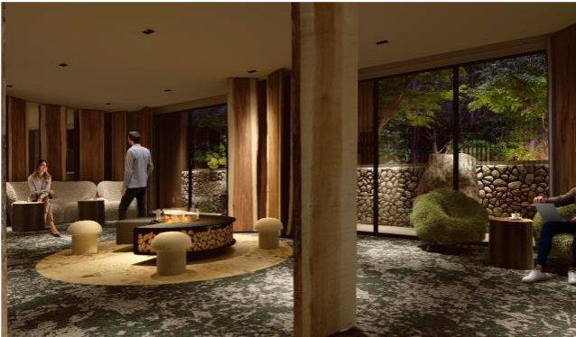
Image representation of entrance

local vegetation. Additionally, a large natural hot spring bath with a sauna has been put in place so that users can enjoy hot springs, a rarity in Karuizawa, that contain water brought from the hot spring resorts of Kita-Karuizawa and Okuwa.