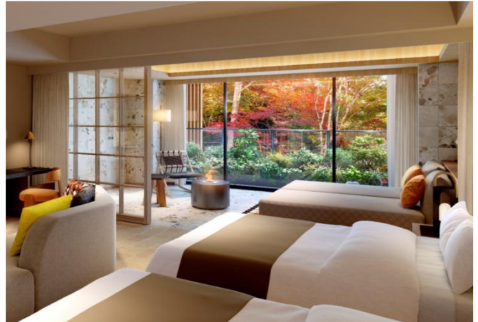
Image representation of guest rooms