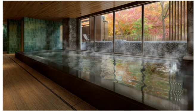
Image representation of large natural hot spring bath with sauna