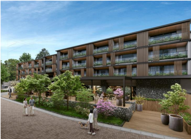
Image representation of external appearance

While Karuizawa is a highly-popular area offering convenient access from greater Tokyo, it contains a large number of stand-alone-type and condominium-type vacation homes, and actually still has very few in the way of hotel condominiums. With the “joy of owning a vacation home” and “ease of maintenance and management” that they offer, hotel condominiums meet broad vacation home needs, and will go on to provide new ways of making it worthwhile to stay in an area that will continue growing as a tourist destination that attracts attention from all over the world.